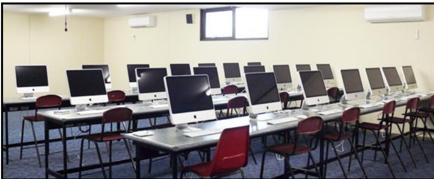
Leon Bishop, Principal

Our new media facilities are almost ready for use. Two new rooms have been added to the multi media centre and have been equipped with the latest Apple computing systems for use in VCE studies in Media, Art and Photography. These facilities have been a long time in coming and were originally financed by the federal Investing in Our Schools Program. There are two new rooms in this facility - one is pictured below.